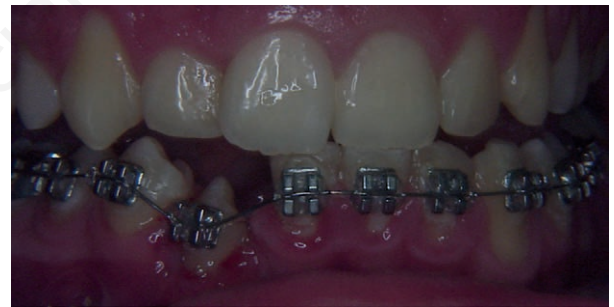
Figure 5. Once the crown is exposed, a bracket is bonded on the vestibular side and inserted into a Ni-Ti arch.

Five months later, the arch alignment was obtained, and two months after debonding was performed, considering the excellent health of periodontal tissues (Figure 6).