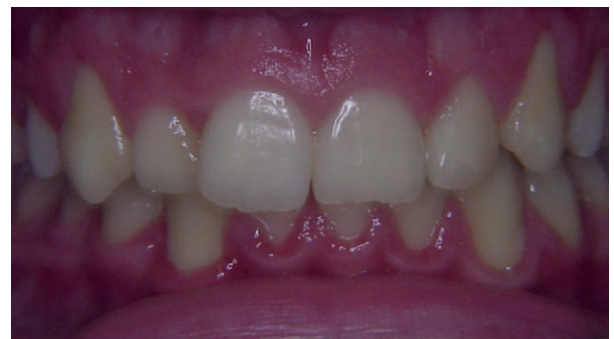
Figure 6. After debonding.