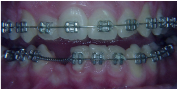
Figure 2. Coil-spring inserted into the wire arch to open the space.