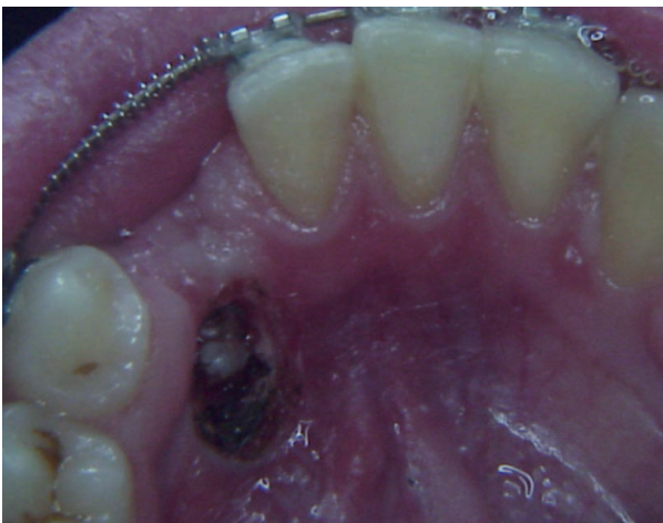
Figure 3. Just after intervention: no bleeding is present.