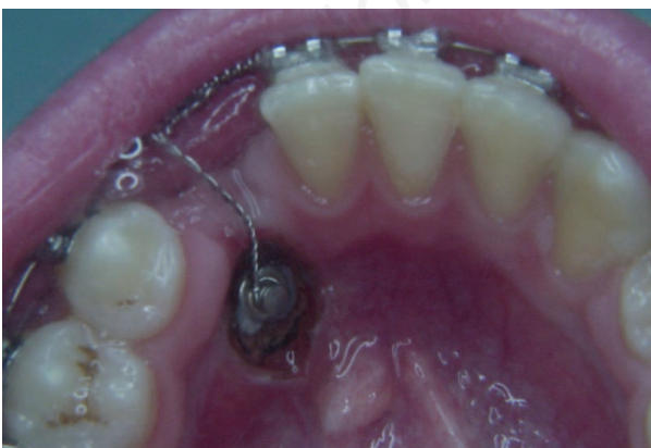
Figure 4. A bracket is bonded after the intervention, and a metallic ligature is applied for elastic traction insertion.

was utilized with a 320 \mu\text{m} diameter optical fiber at 3W CW output power.